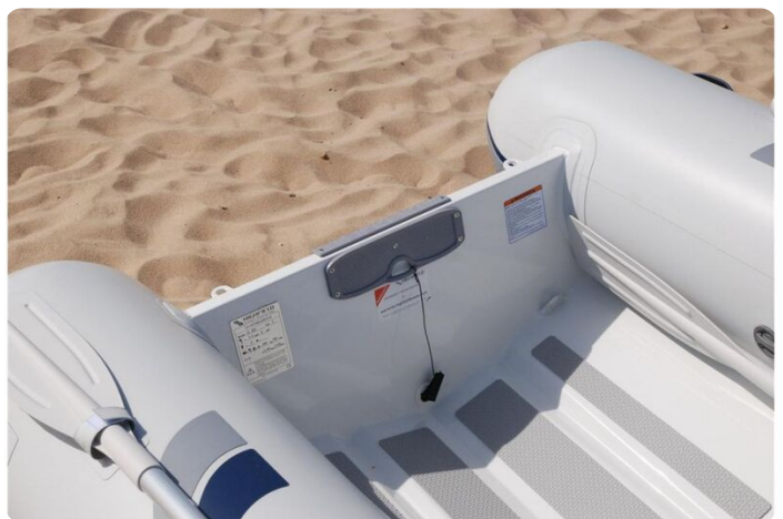
Highfield UL 340 aluminium RIB - deck and transom