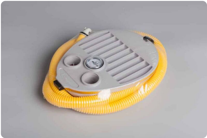
Highfield UL 340 aluminium RIB - pump