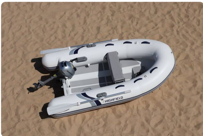
Highfield UL 290 aluminium-RIB - on a beach