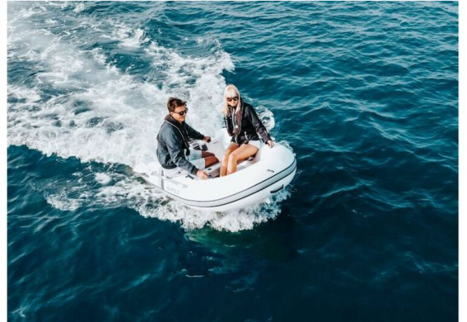
Highfield UL 240 aluminium RIB - moving through the water