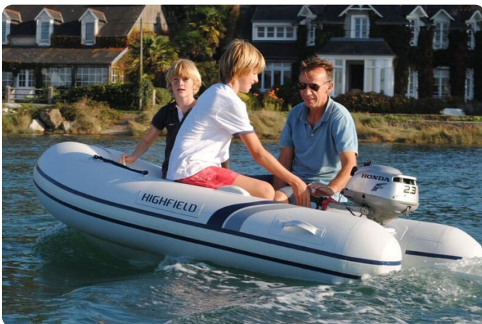
Highfield UL 240 aluminium RIB