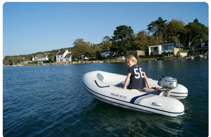
Highfield UL 240 aluminium RIB - on the water