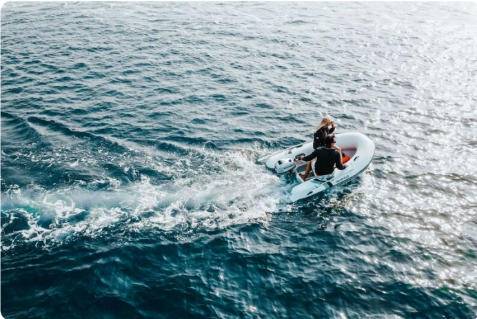
Highfield UL 240 aluminium RIB - overhead view