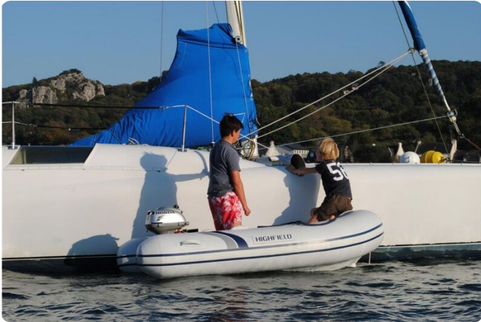
Highfield UL 240 aluminium RIB - next to larger boat