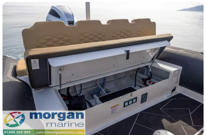
Highfield Sport 800 aluminium RIB - storage under seating