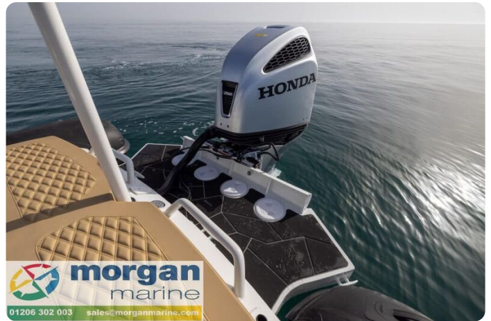
Highfield Sport 800 aluminium RIB - transom with Honda outboard