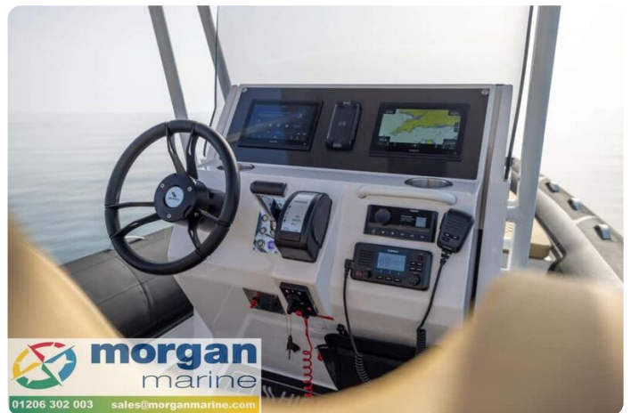
Highfield Sport 800 aluminium RIB - helm position with engine controls and electronics