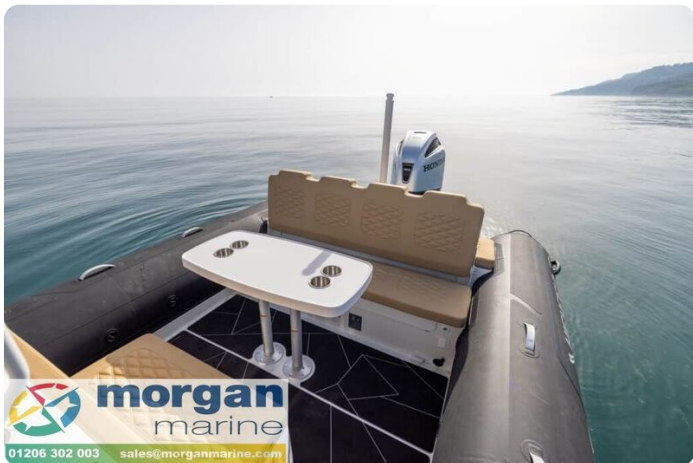
Highfield Sport 800 aluminium RIB - aft table and seating