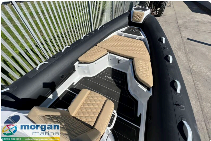
Highfield Sport 700 - bow cushions and forward console seat - without infill