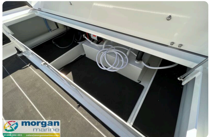
Highfield Sport 700 - storage compartment