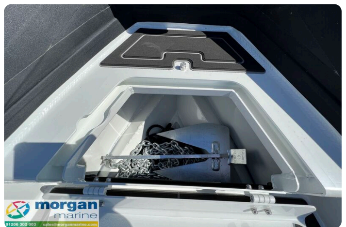
Highfield Sport 700 - anchor locker