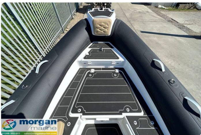
Highfield Sport 700 - bow locker closed