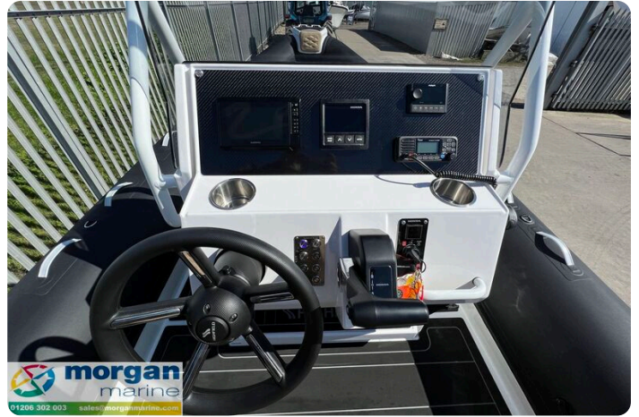
Highfield Sport 700 - engine controls