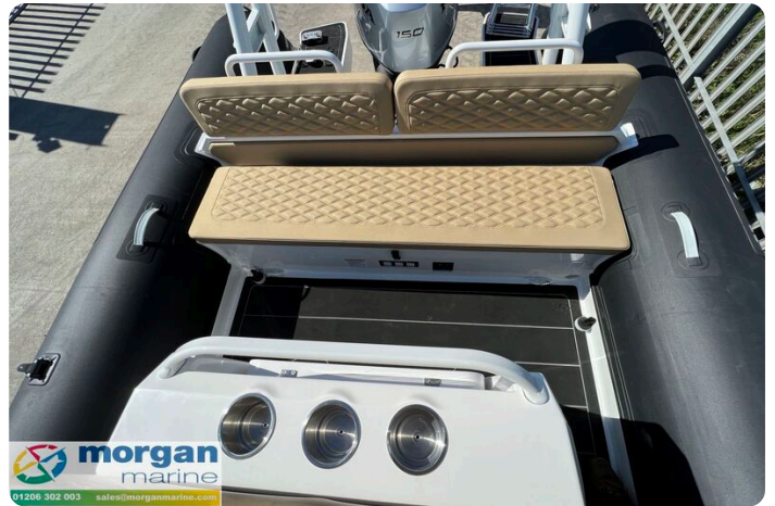
Highfield Sport 700 - seating and drinks holders