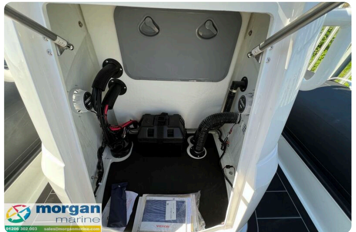
Highfield Sport 700 - battery compartment