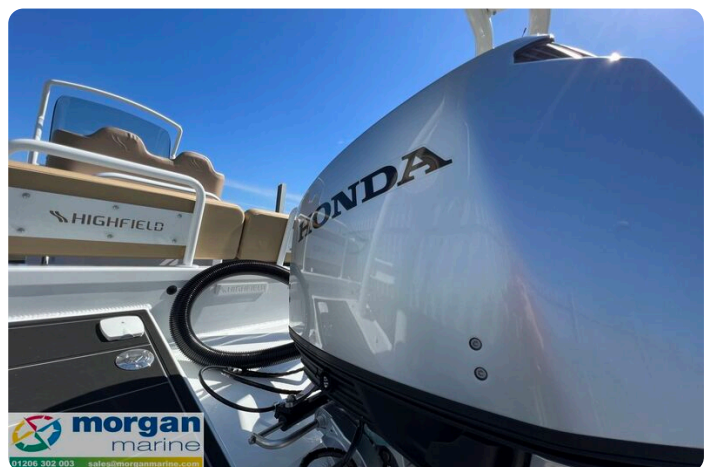
Highfield Sport 700 - Honda engine cowl