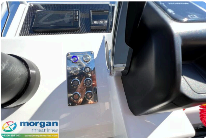
Highfield Sport 700 - switch panel