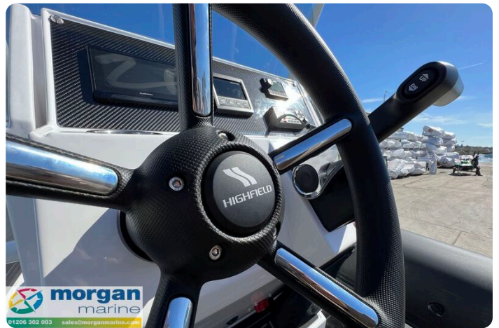
Highfield Sport 700 - steering wheel and dash