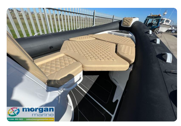
\label{thm:light} \mbox{Highfield Sport 700 - bow cushions and forward console seat - with infill}