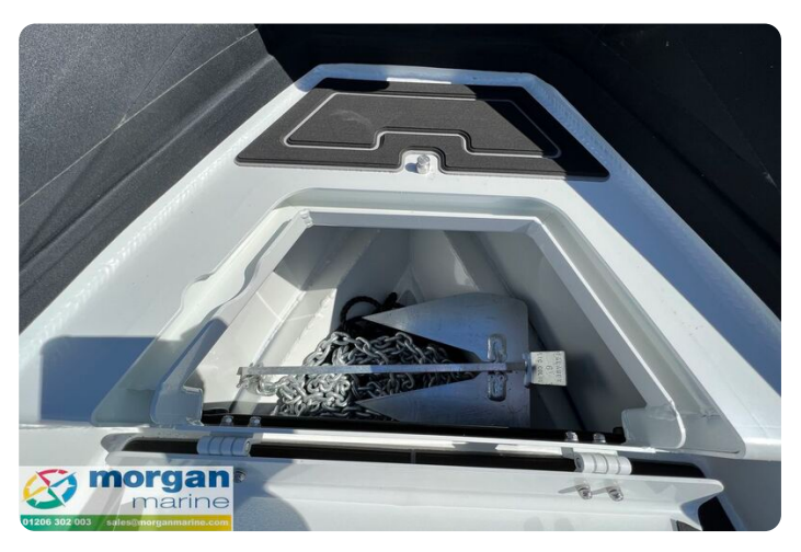
Highfield Sport 700 - anchor locker