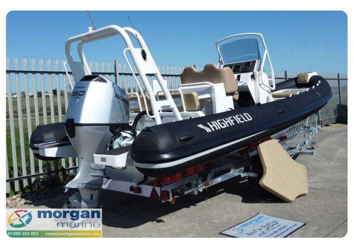
Highfield Sport 700 - A-frame