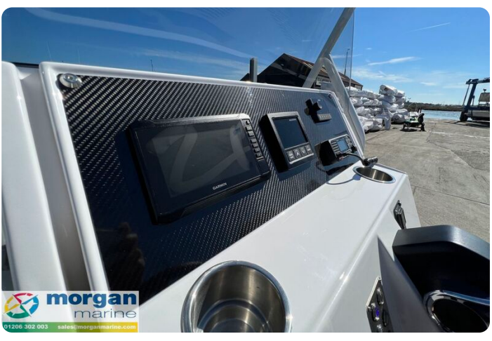
Highfield Sport 700 - display screens