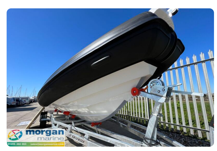
Highfield Sport 700 - bow