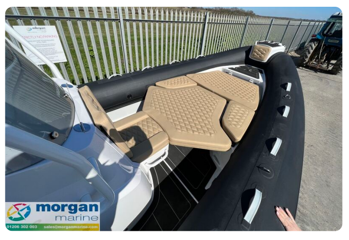
Highfield Sport 700 - bow cushions with sun lounger infill