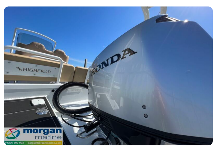
Highfield Sport 700 - Honda engine cowl