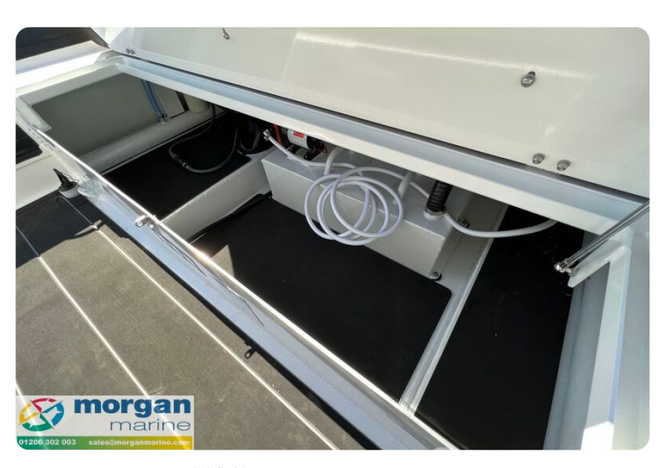
Highfield Sport 700 - storage compartment