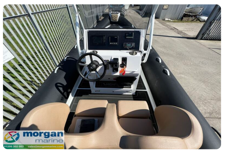
Highfield Sport 700 - console and seating