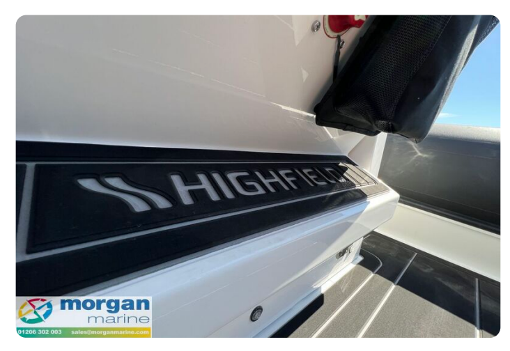
Highfield Sport 700 - decals