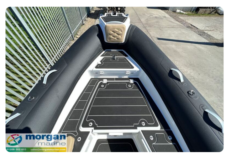
Highfield Sport 700 - bow locker closed