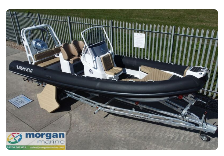
Highfield Sport 700 - overhead view from starboard side