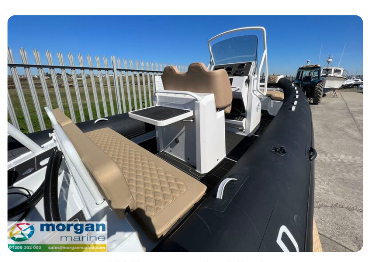
Highfield Sport 700 - starboard side tubes