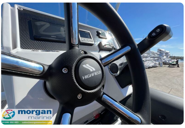
Highfield Sport 700 - steering while and dash