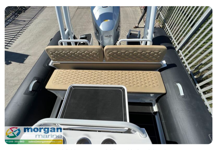
\label{thm:eq:high-field} \mbox{High-field Sport 700 - folding table for aft bench}