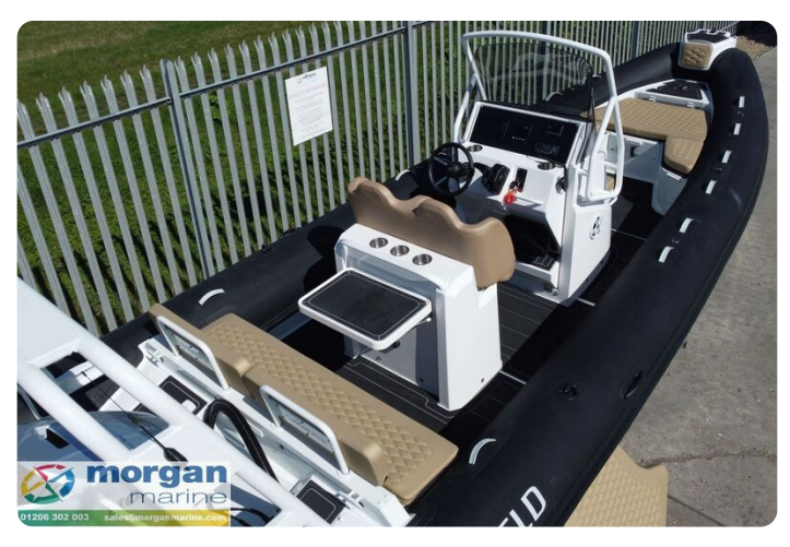
Highfield Sport 700 - seating