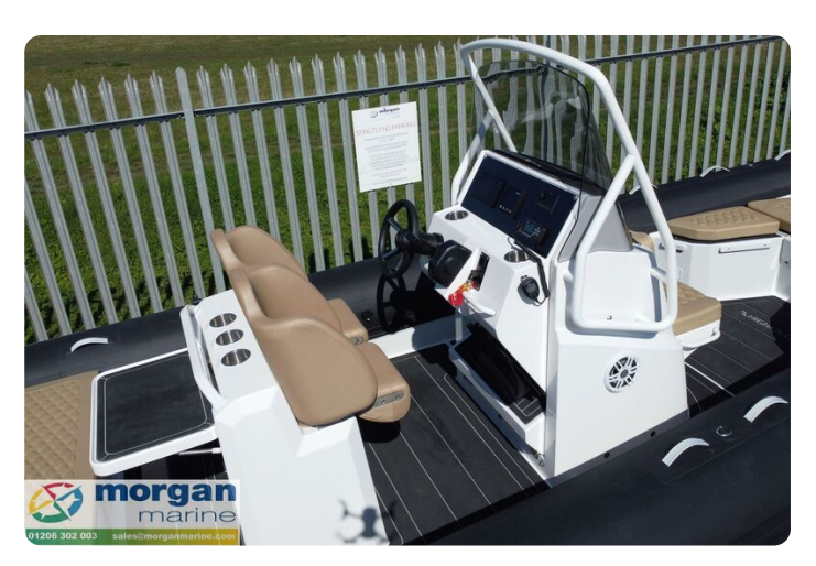
Highfield Sport 700 - helm position