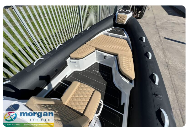
Highfield Sport 700 - bow cushions and forward console seat - without infill \,