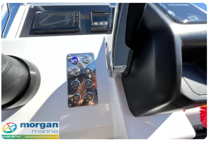
Highfield Sport 700 - switch panel