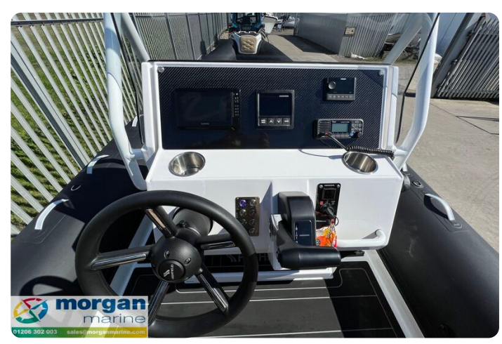
Highfield Sport 700 - engine controls