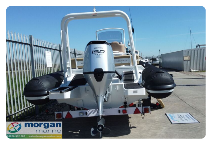
\label{eq:highfield Sport 700 - transom and engine} \label{eq:highfield Sport 700 - transom and engine}