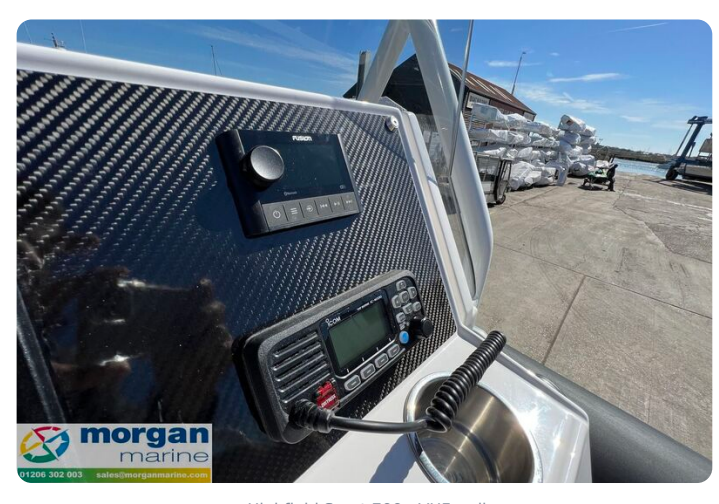
Highfield Sport 700 - VHF radio