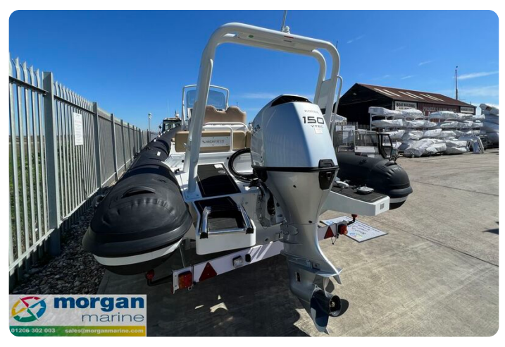
Highfield Sport 700 - port side of engine