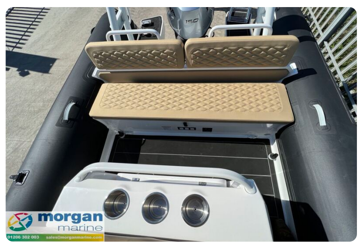
Highfield Sport 700 - seating and drinks holders