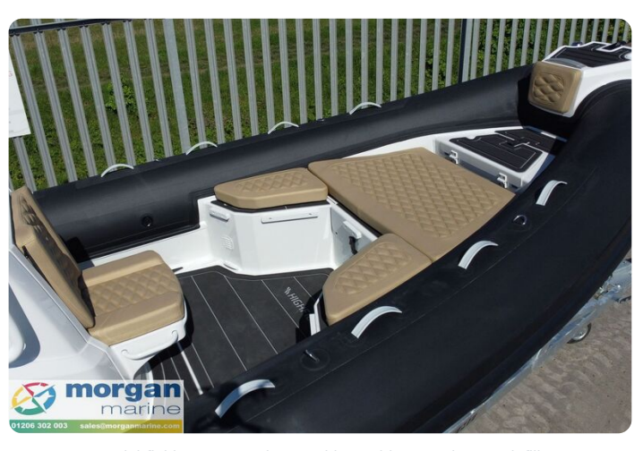
\label{thm:light} \mbox{Highfield Sport 700 - bow cushions without sunlounger in fill}