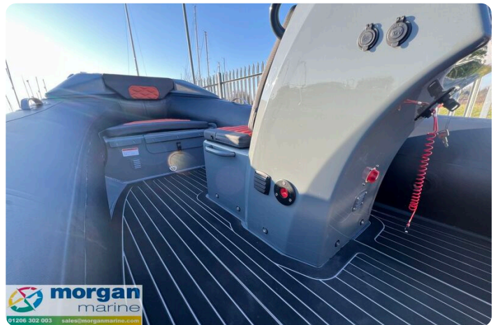
Highfield Sport 420 - deck