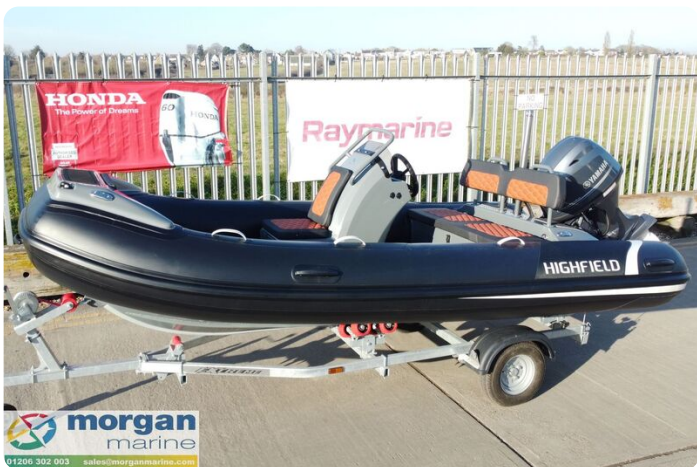
Highfield Sport 420 - Side