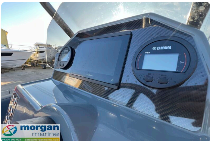
Highfield Sport 420 - Garmin