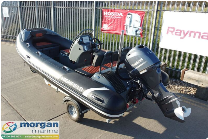
Highfield Sport 420 - stern