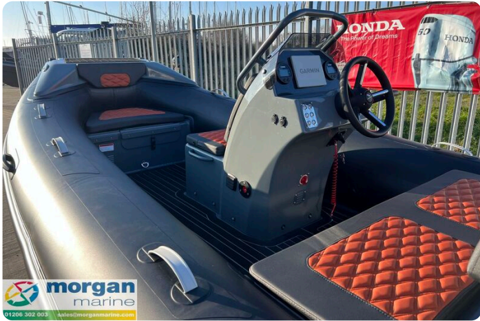
Highfield Sport 420 - handles