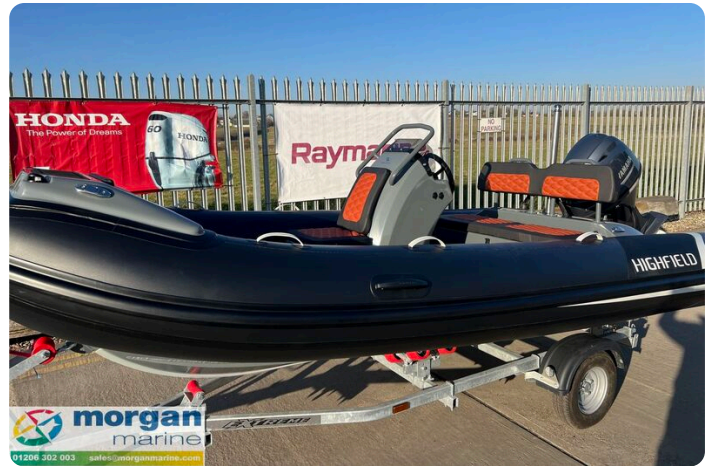
Highfield Sport 420 - forward seat