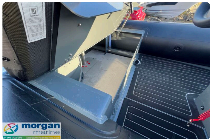
Highfield Sport 420 - locker