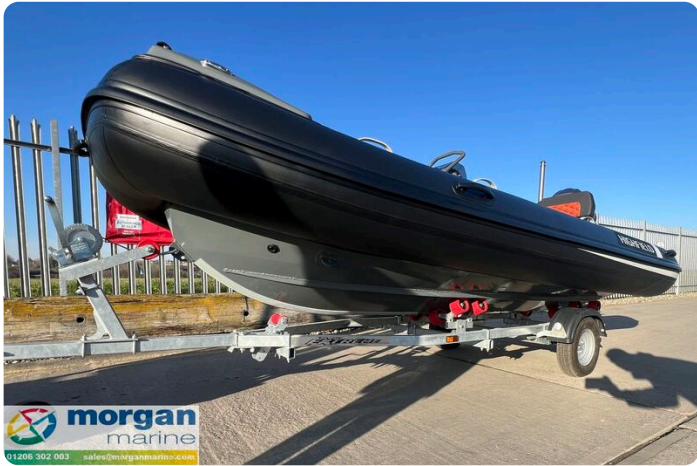
Highfield Sport 420 - hull bottom