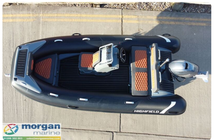
Highfield Sport 420 - overview