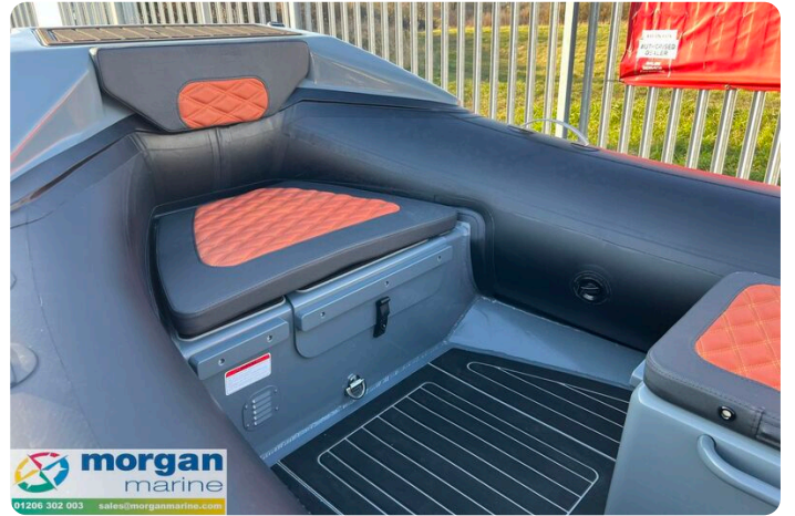
Highfield Sport 420 - bow seat