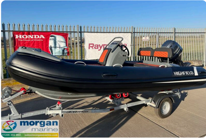
Highfield Sport 420 - Main