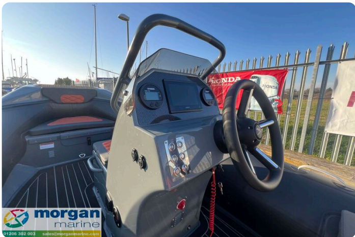
Highfield Sport 420 - wheel