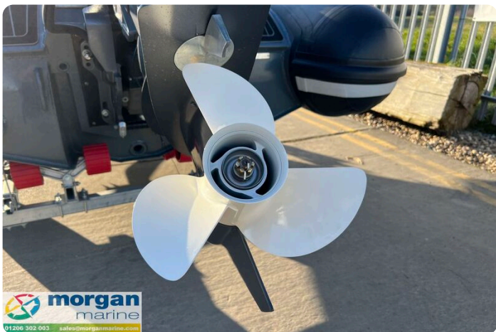
Highfield Sport 420 - prop