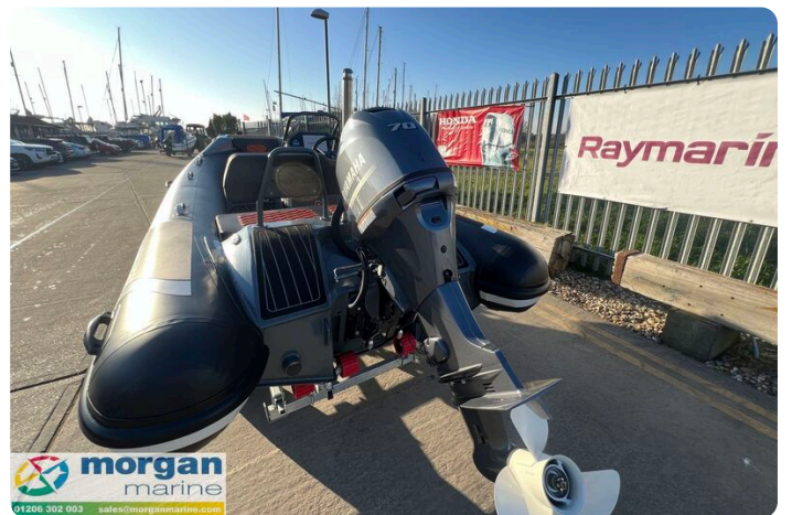
Highfield Sport 420 - engine