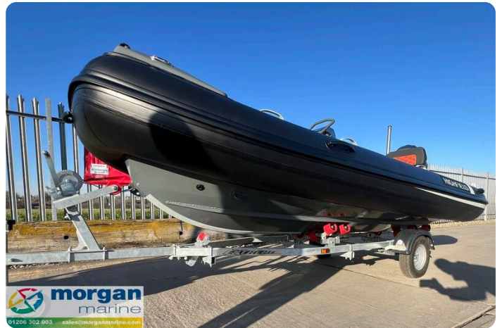
Highfield Sport 420 - hull