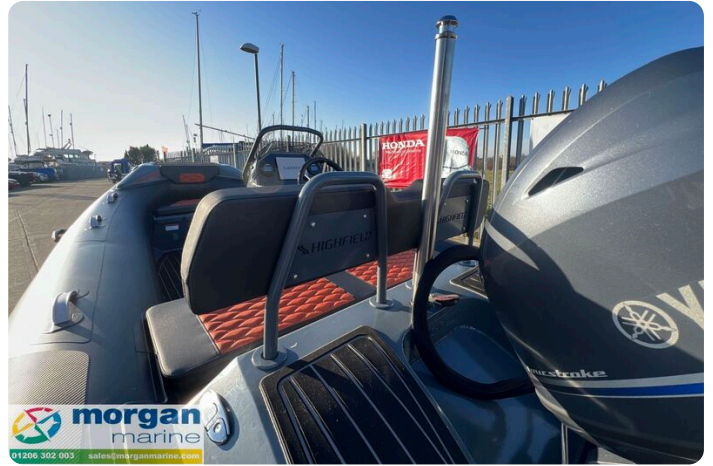
Highfield Sport 420 - bench seating