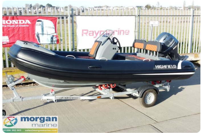
Highfield Sport 420 - trailer