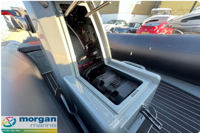
Highfield Sport 420 - console locker