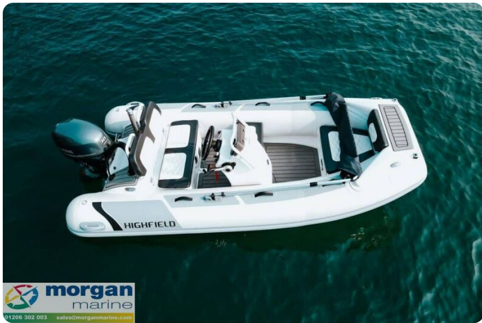
Highfield Sport 360 aluminium RIB