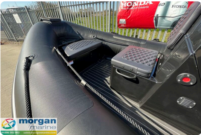
Highfield Patrol 500 aluminium RIB - bow seating