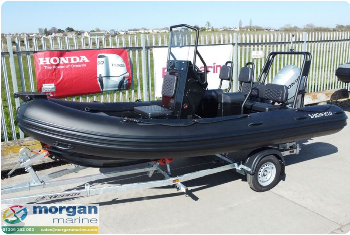
Highfield Patrol 500 aluminium RIB