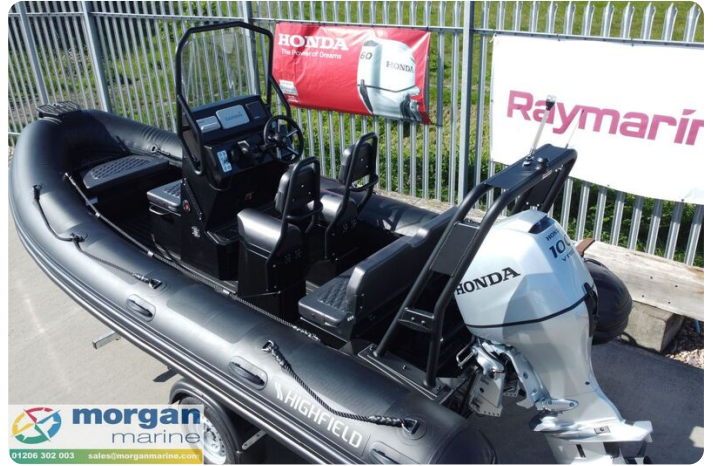
Highfield Patrol 500 aluminium RIB - overhead view of console