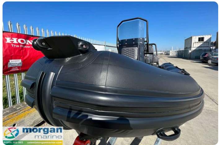
Highfield Patrol 500 aluminium RIB - bow and tubes