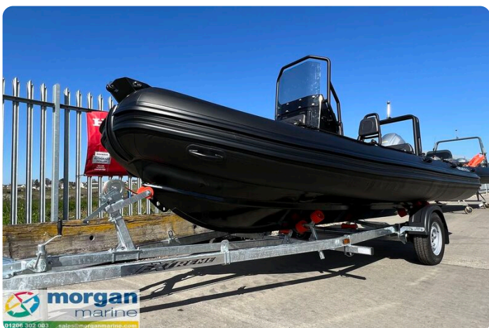
Highfield Patrol 500 aluminium RIB - under bow and hull