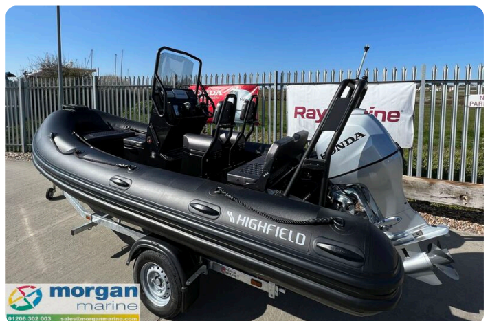
Highfield Patrol 500 aluminium RIB - A-frame