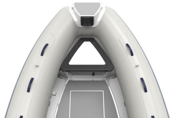
Highfield Classic 420 aluminium RIB - bow