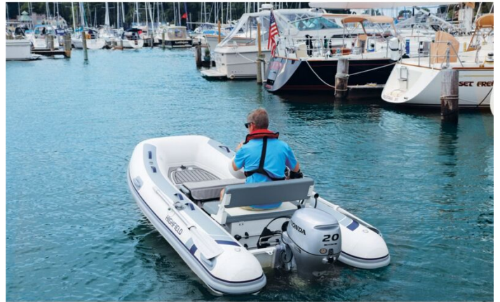
Highfield CL 360 aluminium RIB - along side larger boats