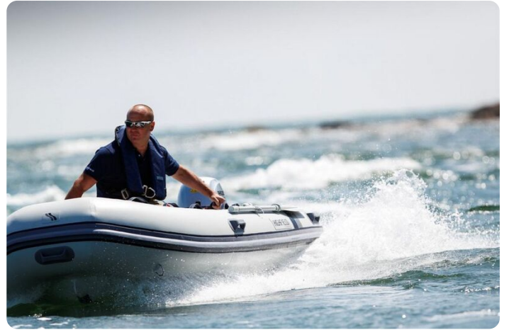
Highfield CL 360 aluminium RIB - view towards bow