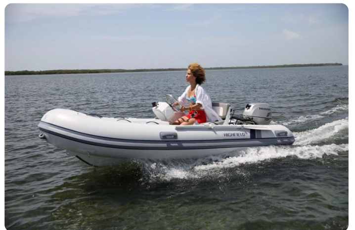
Highfield CL 360 aluminium RIB - on the water