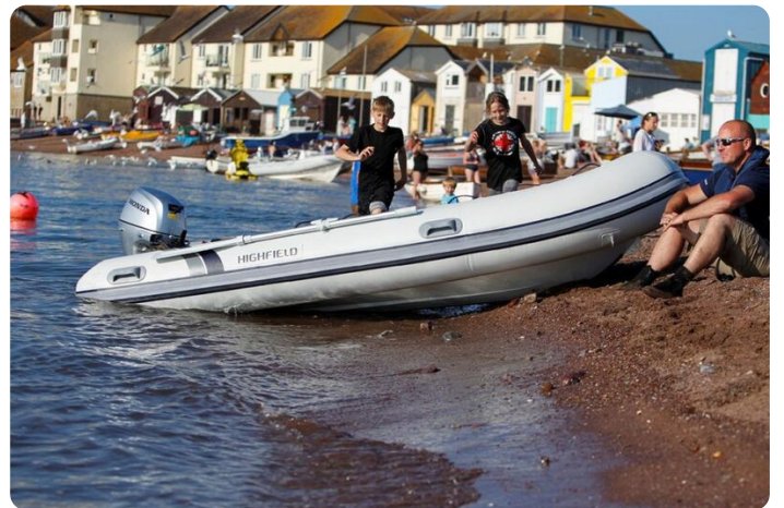
Highfield CL 360 aluminium RIB - port side