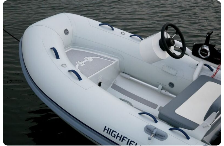
Highfield CL 340 aluminium RIB - bow