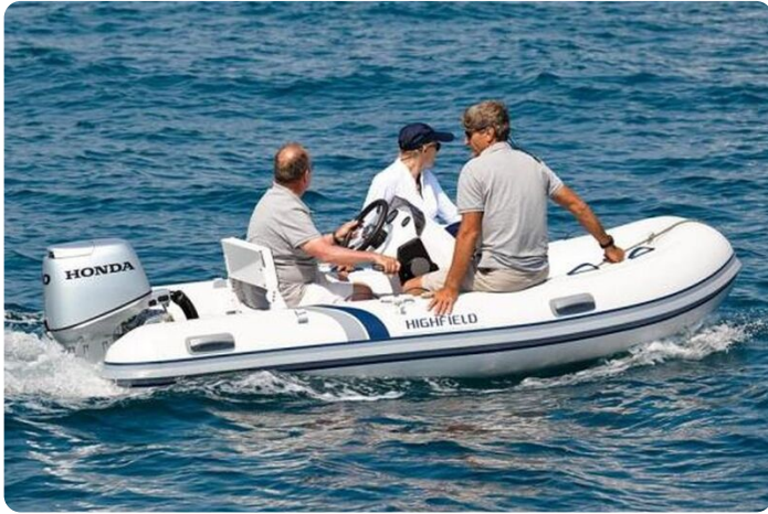
Highfield CL 260 aluminium RIB