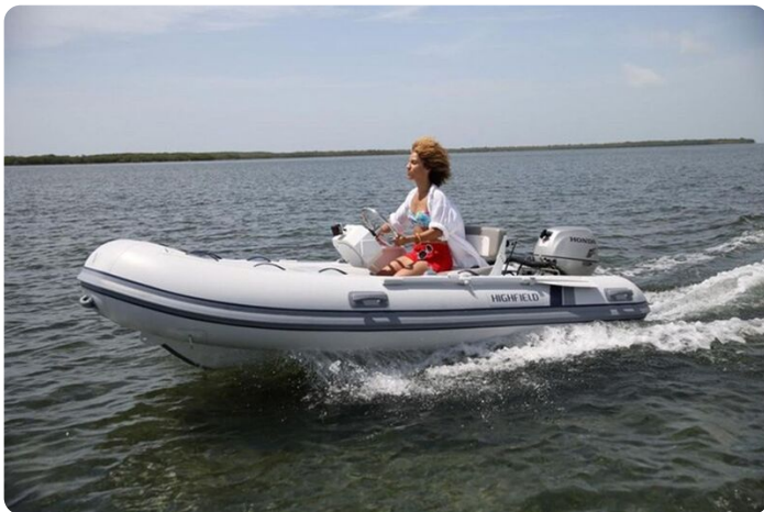
Highfield CL 260 aluminium RIB - on the water