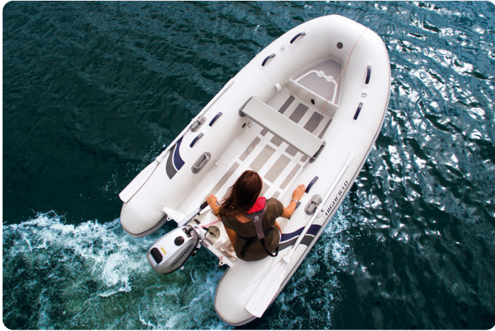
Highfield CL340 aluminium RIB - overhead view