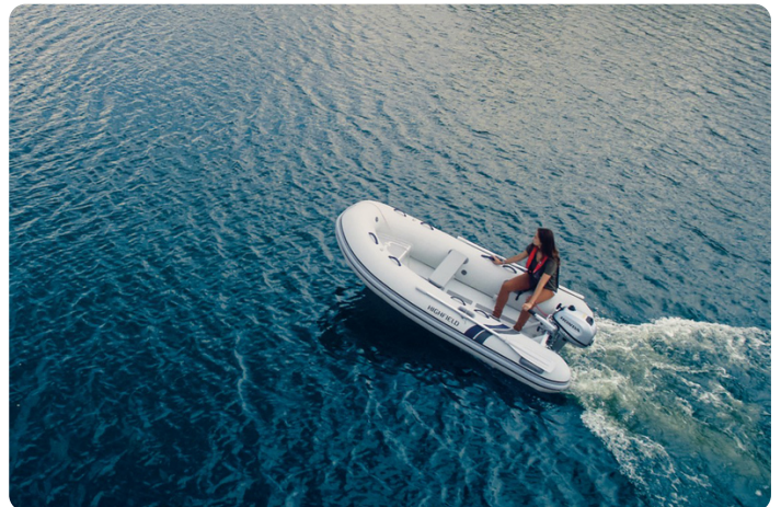
Highfield CL340 aluminium RIB - birdseye view