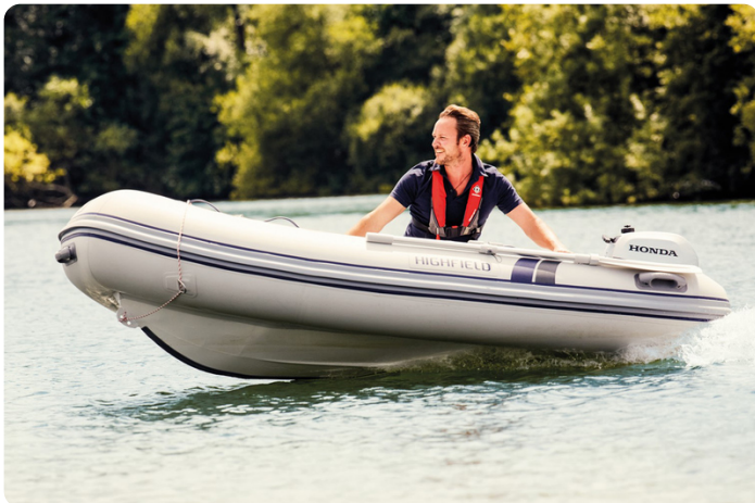
Highfield CL340 aluminium RIB