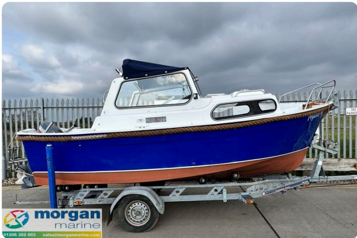
Hardy PH 17 - side view