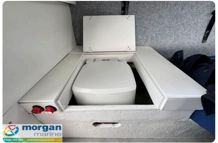
Hardy PH 17 - toilet