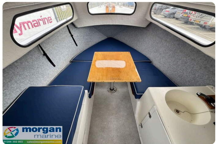
Hardy PH 17 - saloon