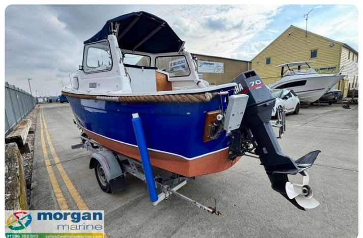
Hardy PH 17 - engine