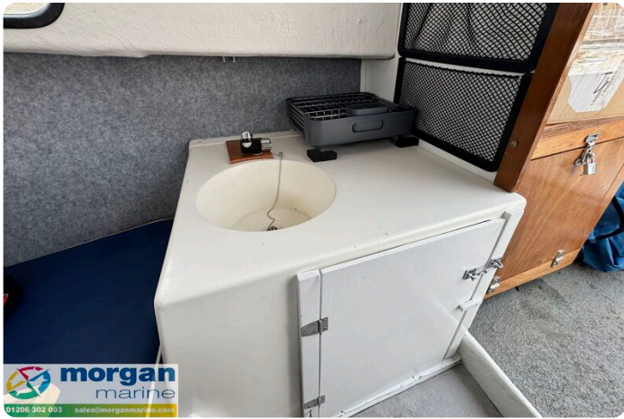
Hardy PH 17 - sink