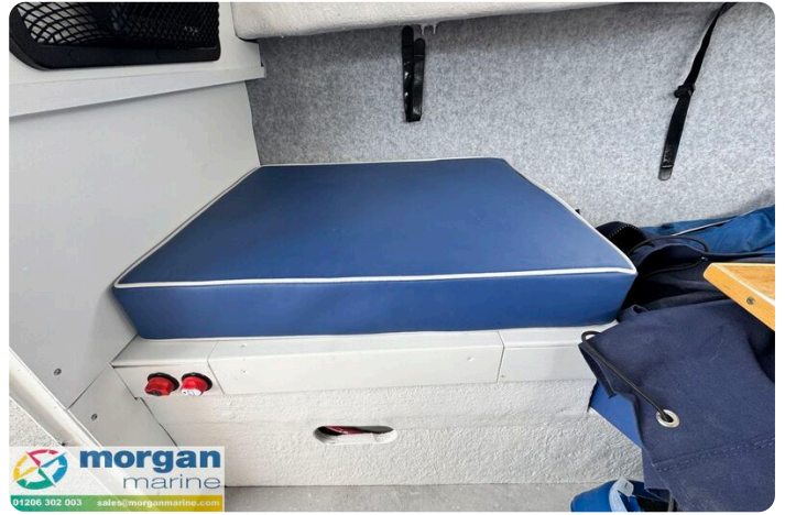
Hardy PH 17 - seating