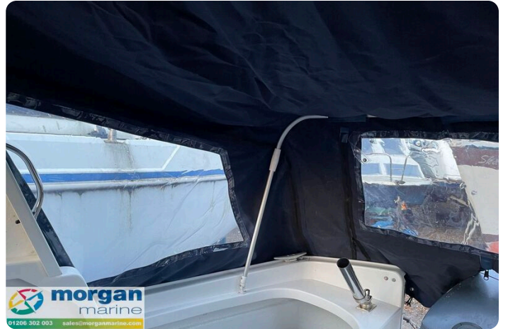
Hardy PH 17 - Canopy