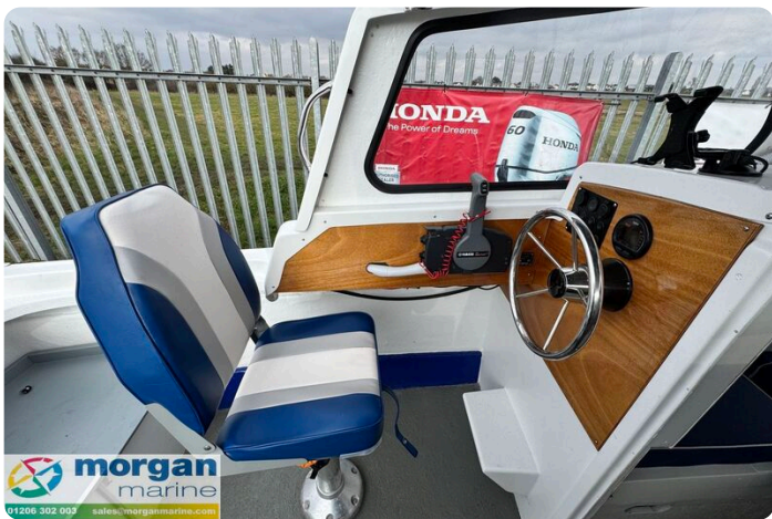
Hardy PH 17 - pilot