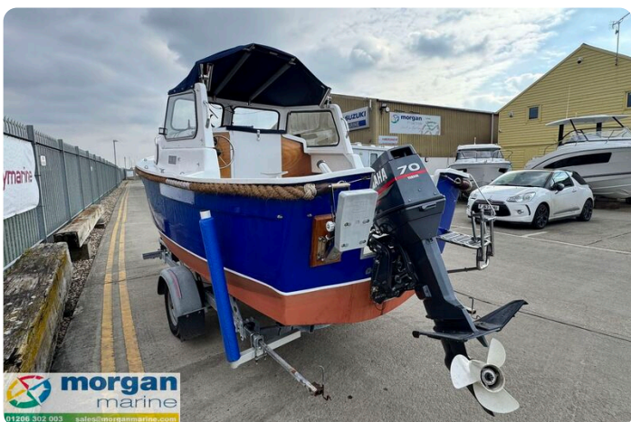
Hardy PH 17 - engine back