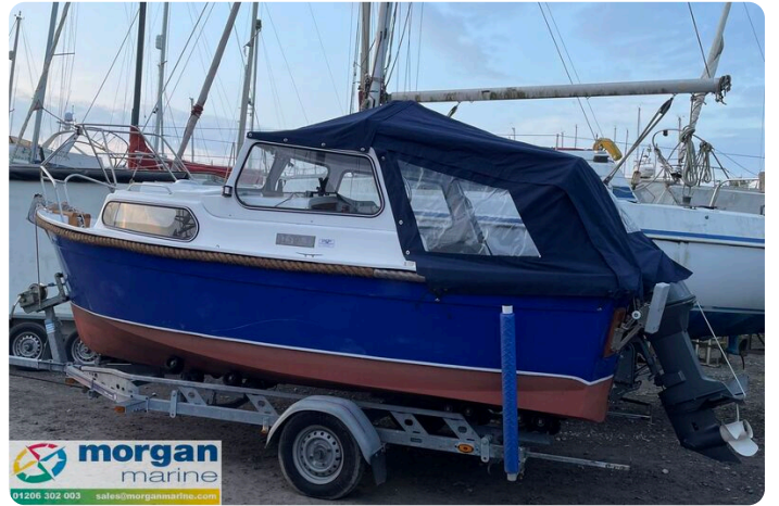
Hardy PH 17 - back canopy