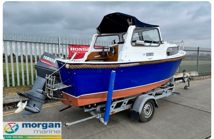
Hardy PH 17 - back