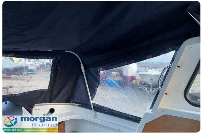
Hardy PH 17 - window