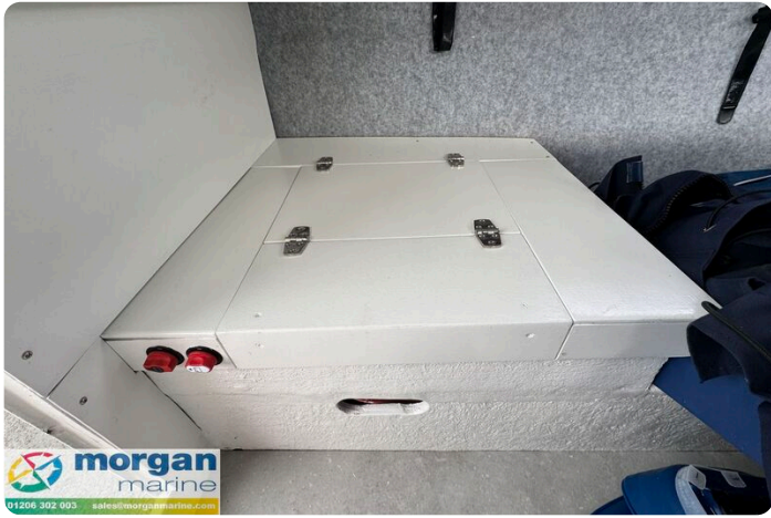
Hardy PH 17 - Switch