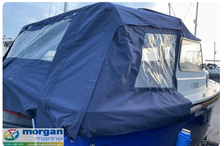
Hardy PH 17 - canopy on