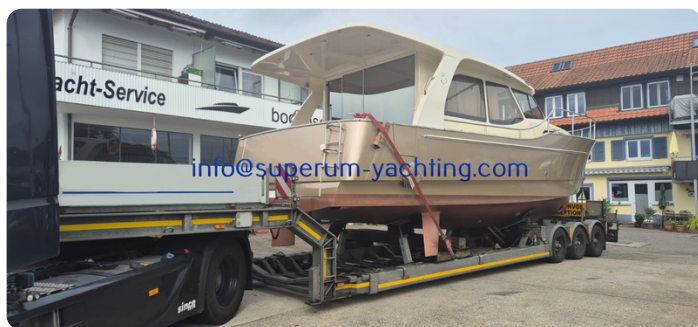
WhatsApp Image 2024-07-12 at 10.08.26