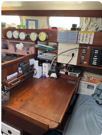
Phantom 35 TOWANDA 50