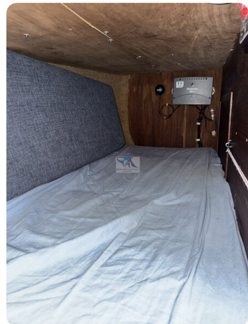
Phantom 35 TOWANDA 51