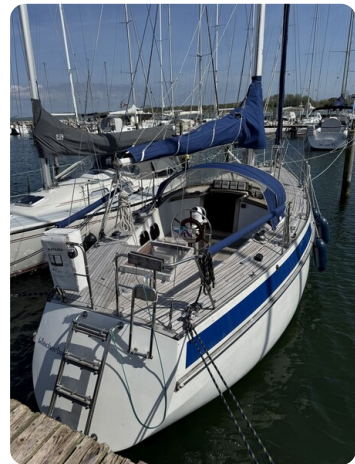
Phantom 35 TOWANDA 104