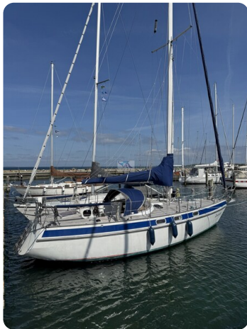
Phantom 35 TOWANDA 105