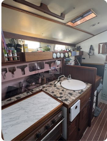
Phantom 35 TOWANDA 49