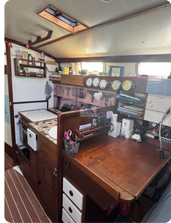
Phantom 35 TOWANDA 61