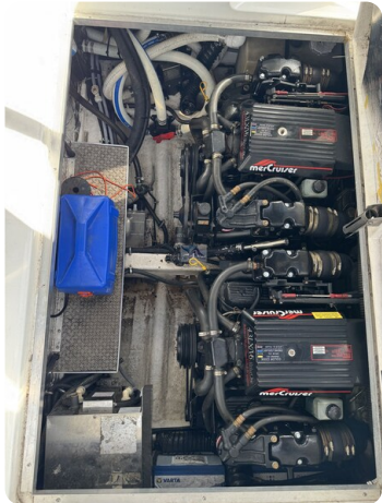
Formula BALU 21