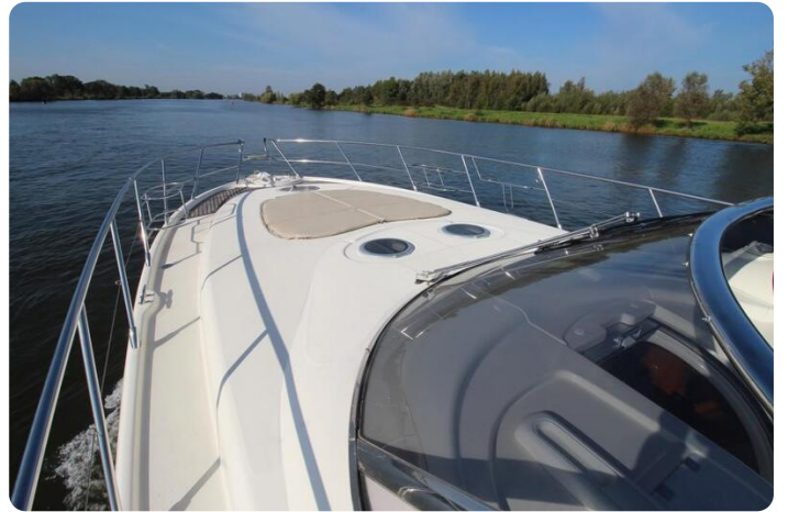
Cranchi Mediterranée 50