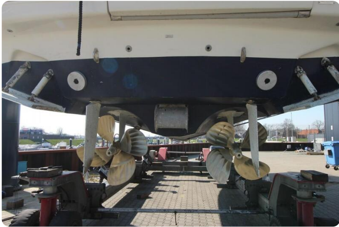
Cranchi Mediterranée 50