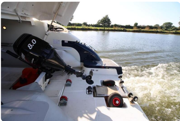
Cranchi Mediterranée 50