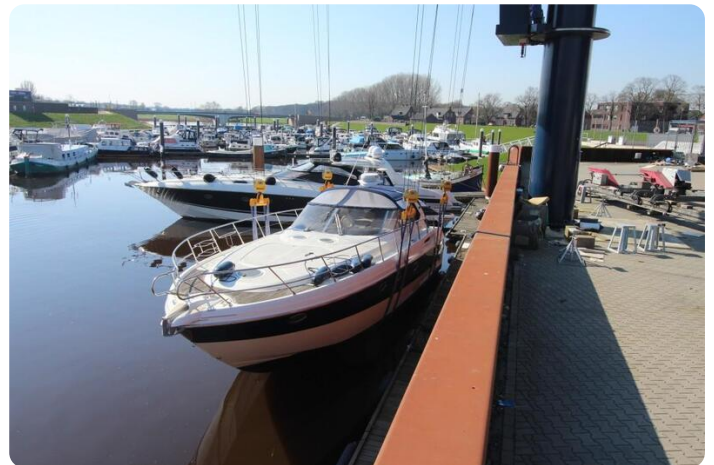
Cranchi Mediterranée 50