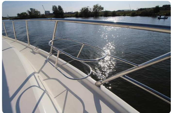
Cranchi Méditerranée 50