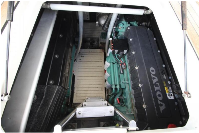
Cranchi Mediterranée 50