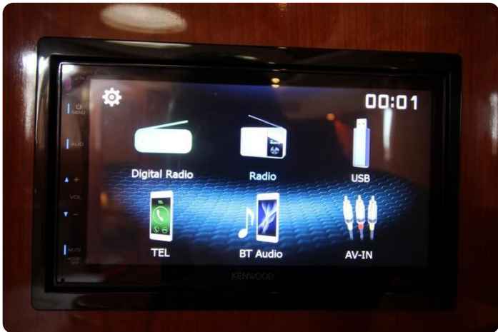
Cranchi Mediterranée 50