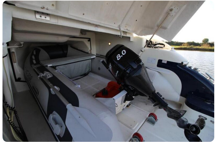
Cranchi Mediterranée 50