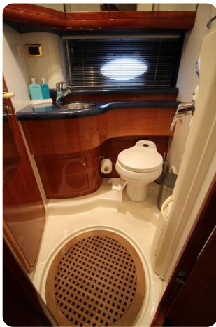
Cranchi Mediterranée 50