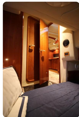
Cranchi Mediterranée 50