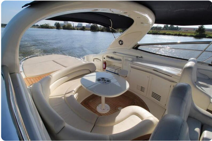
Cranchi Mediterranée 50