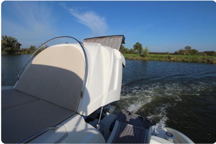
Cranchi Mediterranée 50