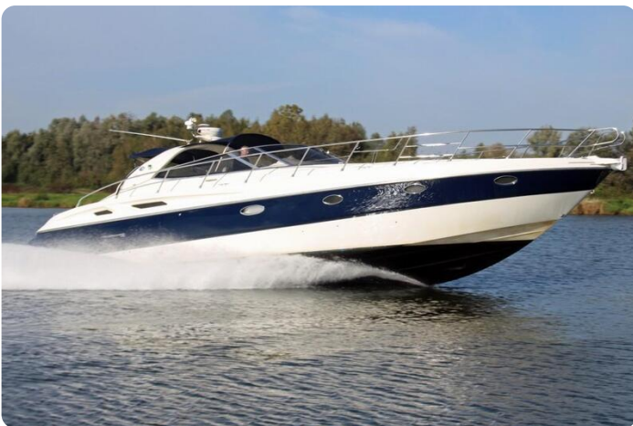
Cranchi Mediterrané 50