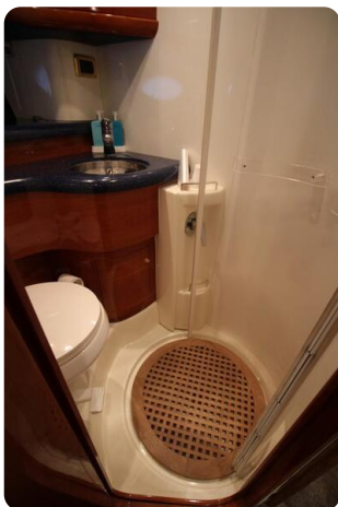
Cranchi Mediterranée 50