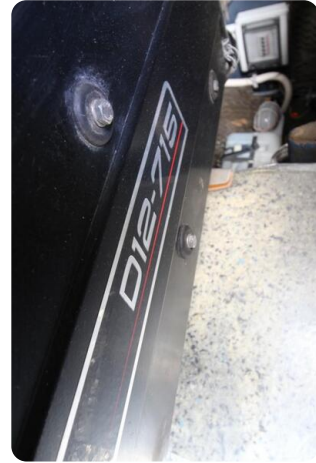
Cranchi Mediterranée 50