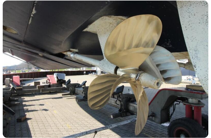
Cranchi Mediterranée 50