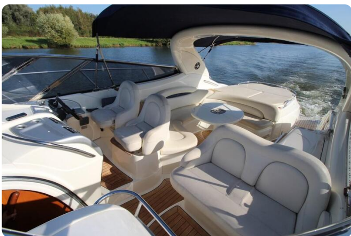
Cranchi Méditerranée 50