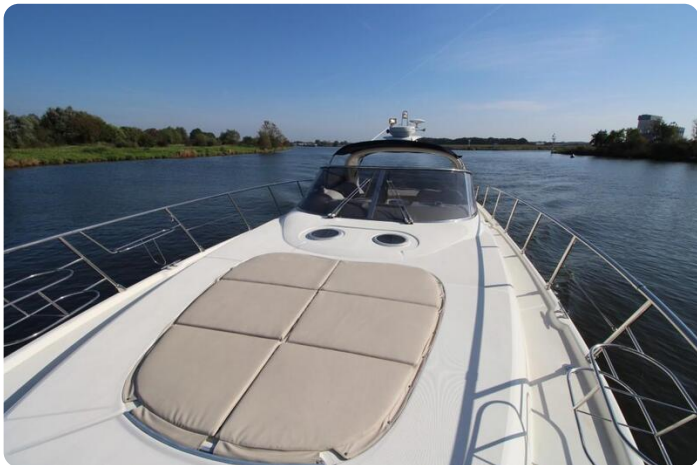
Cranchi Méditerranée 50