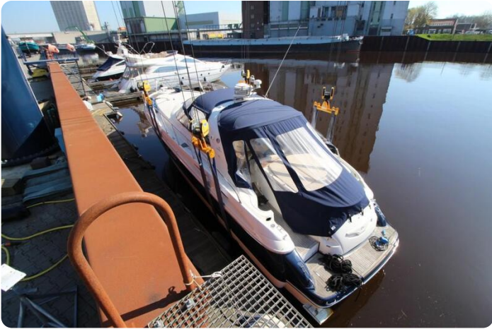
Cranchi Mediterranea 50