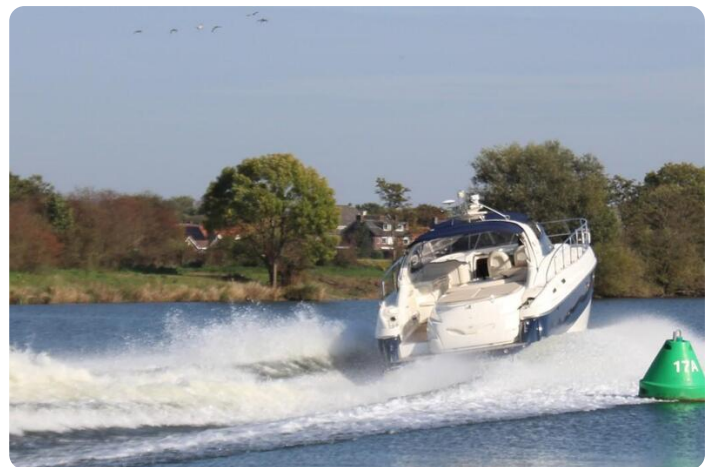
Cranchi Mediterrané 50