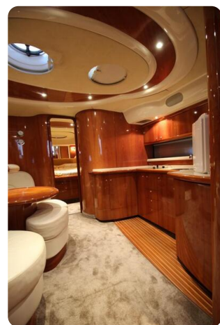
Cranchi Mediterranée 50