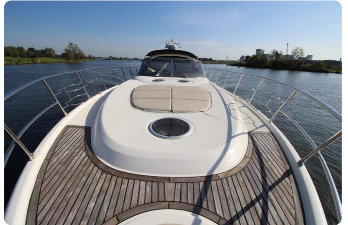
Cranchi Mediterranée 50