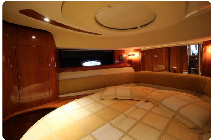
Cranchi Mediterranée 50