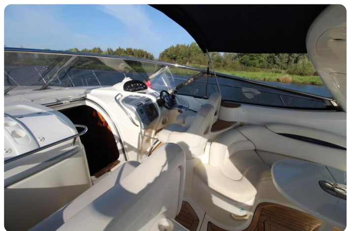
Cranchi Méditerranée 50