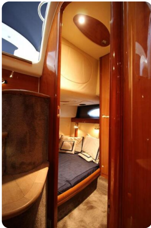
Cranchi Mediterranée 50