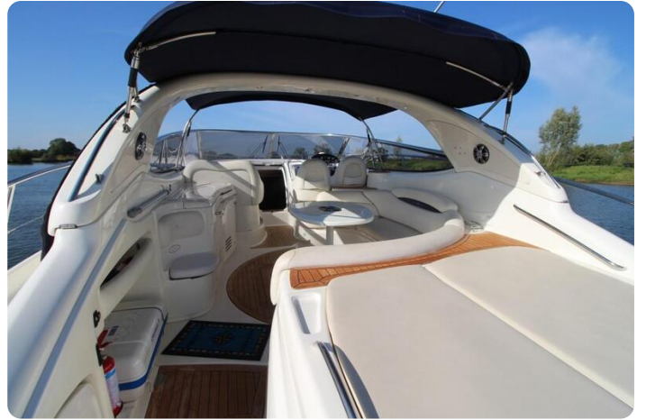
Cranchi Mediterranée 50