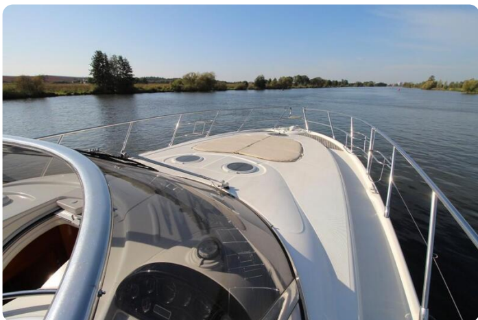
Cranchi Mediterranée 50