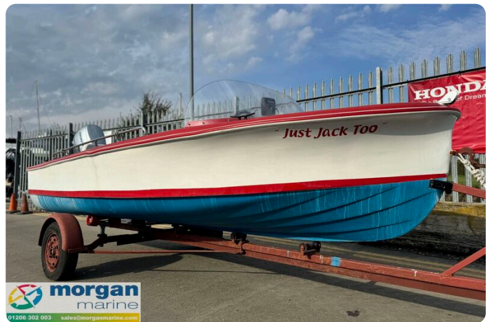
Classic mid-1970s river launch-main