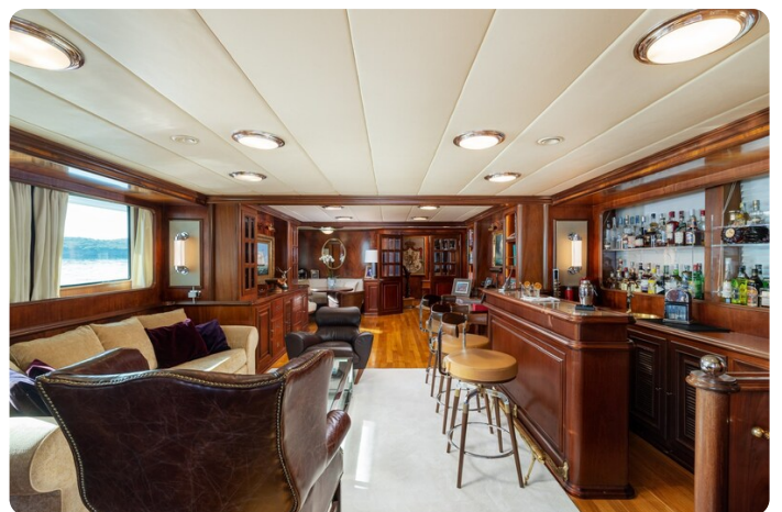
Aquarius IV Living Fwd View