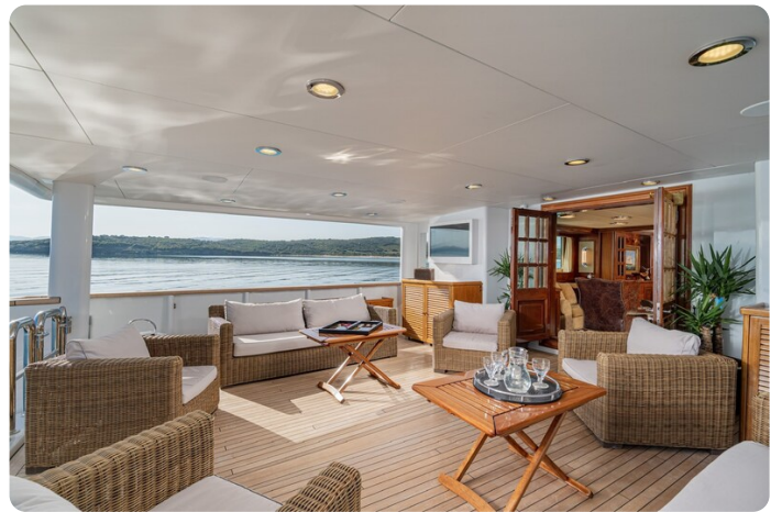
Aquarius IV Stern Dinette