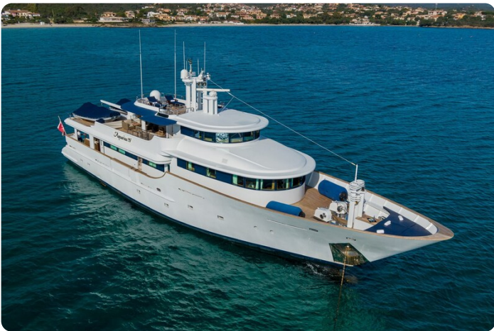
Aquarius IV Fwd Aerial Profile