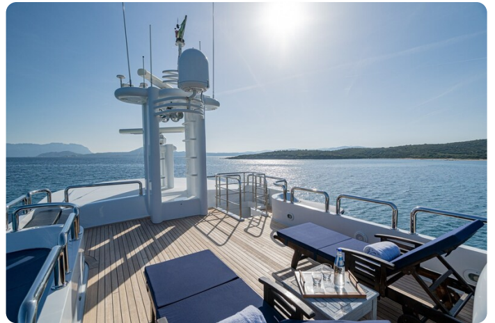
Aquarius IV Fly