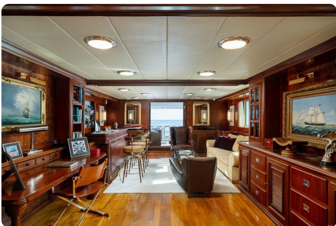
Aquarius IV Living Aft View