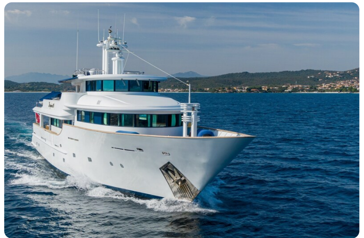
Aquarius IV Fwd Profile