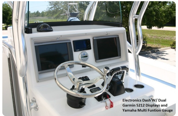
Electronics Dash W/ Dual Garmin 5212 Displays and Yamaha Multi Functon Gauge