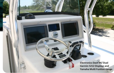
Electronics Dash w/ Dual Garmin 5212 Displays and Yamaha Multi Function Gauge