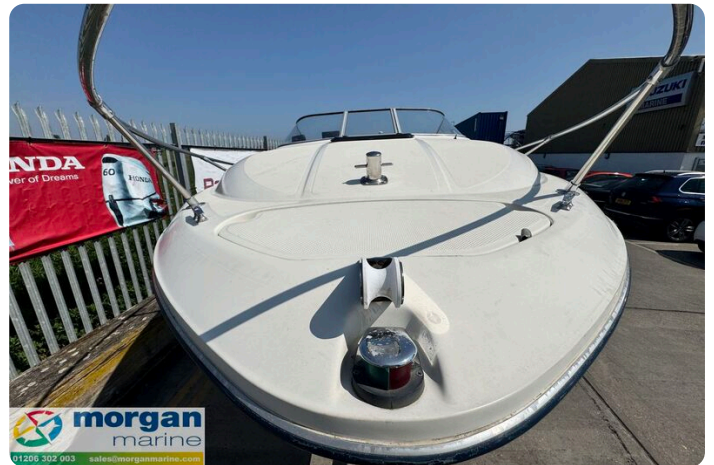
Bayliner 2252 - bow roller