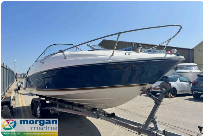
Bayliner 2252 - bow view