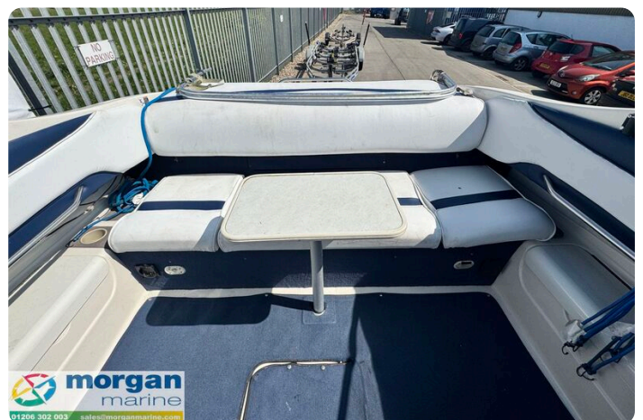
Bayliner 2252 - back seat with table