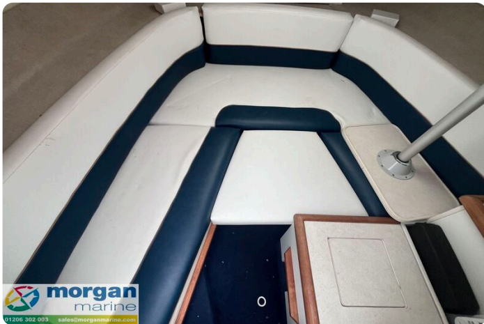
Bayliner 2252 - cabin