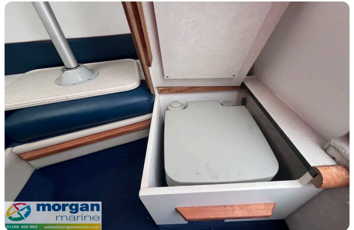
Bayliner 2252 - toilet