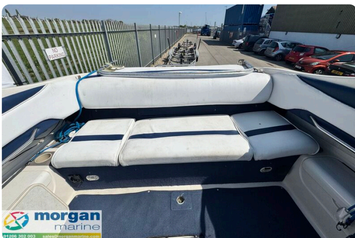
Bayliner 2252 - back seat