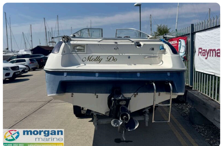
Bayliner 2252 - prop