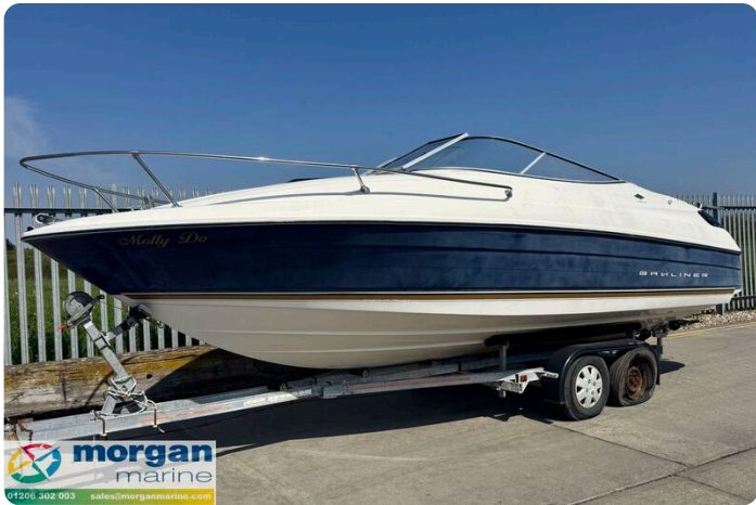
Bayliner 2252 - side view