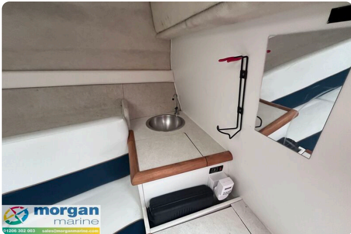
Bayliner 2252 - sink