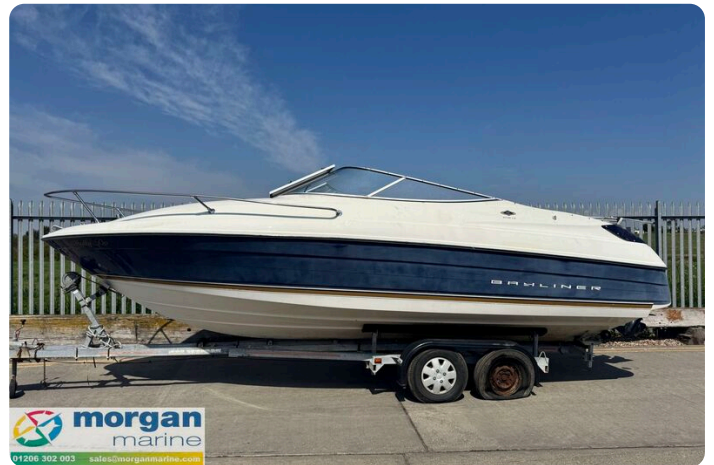
Bayliner 2252 - side