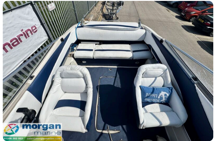
Bayliner 2252 - seating