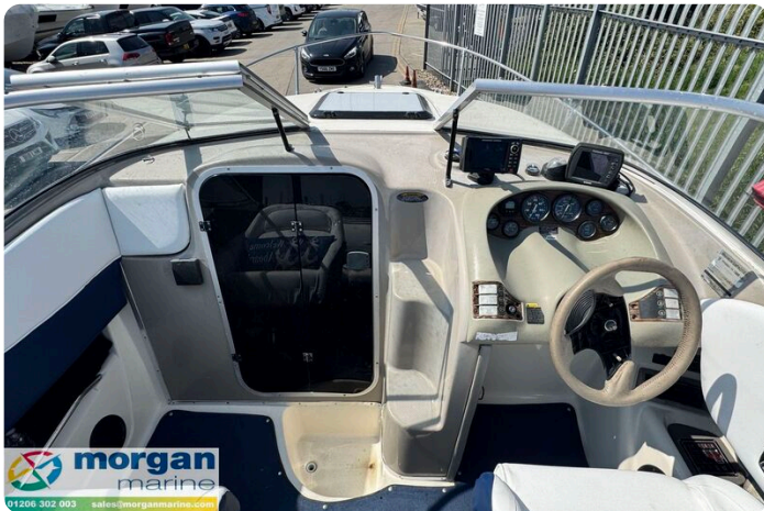
Bayliner 2252 - cabin door