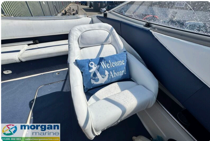
Bayliner 2252 - co pilot seat