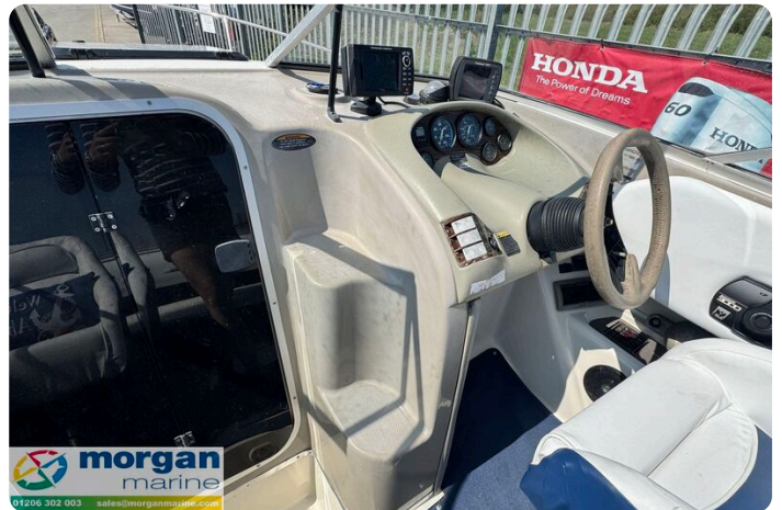
Bayliner 2252 - steps