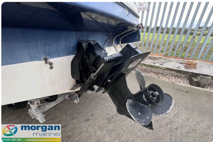
Bayliner 2252 - prop