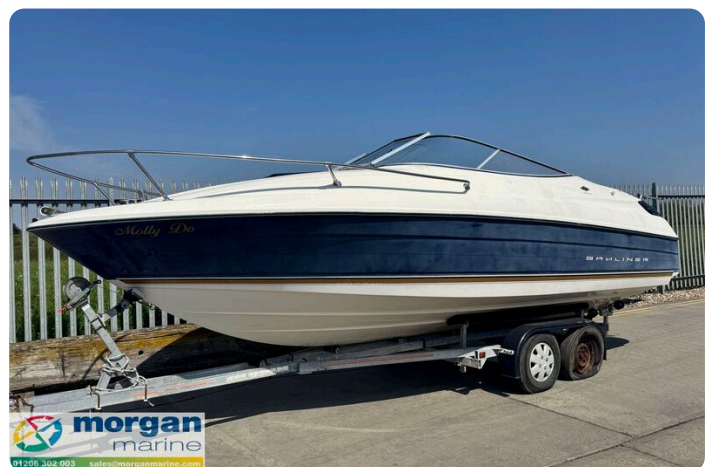
Bayliner 2252 - side view