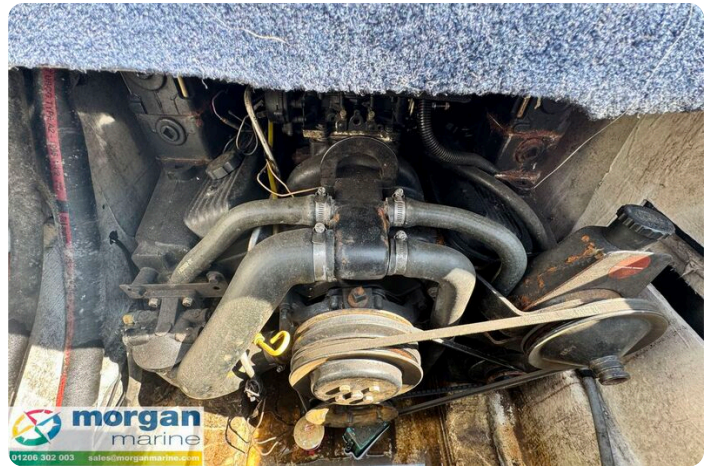
Bayliner 2252 - engine