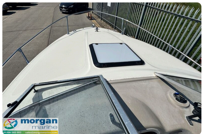
Bayliner 2252 - hatch