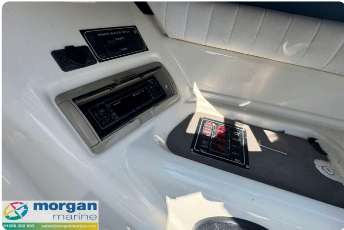
Bayliner 2252 - radio