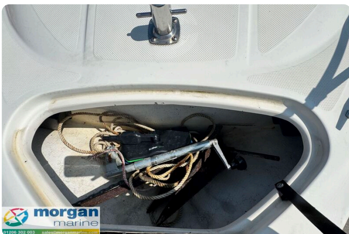
Bayliner 2252 - anchor