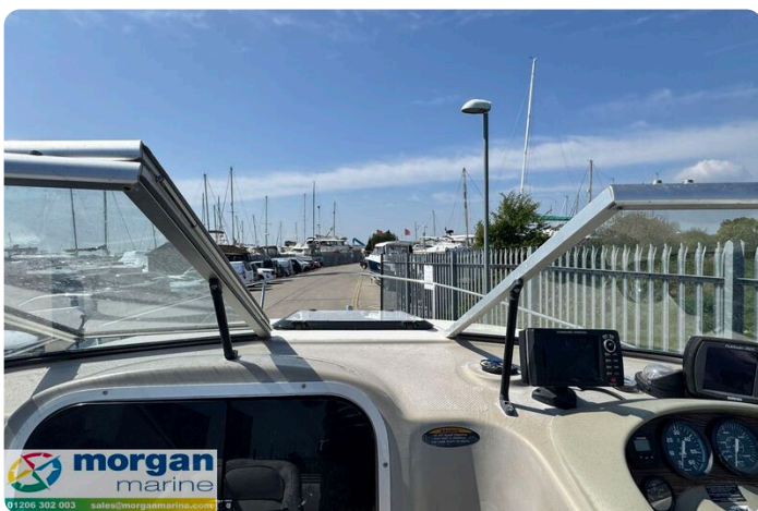
Bayliner 2252 - walk through windscreen