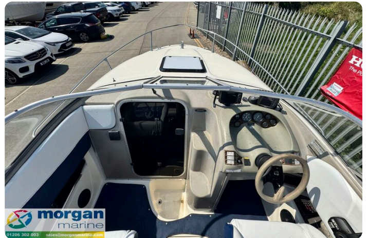
Bayliner 2252 - windscreen