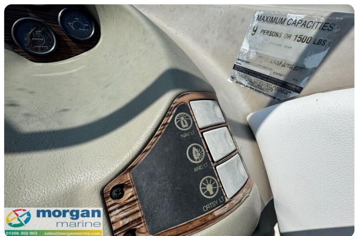
Bayliner 2252 - controls 2