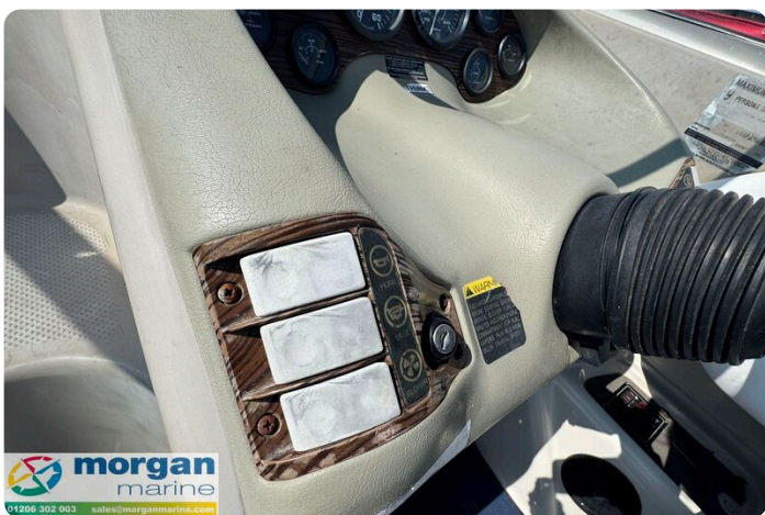
Bayliner 2252 - controls