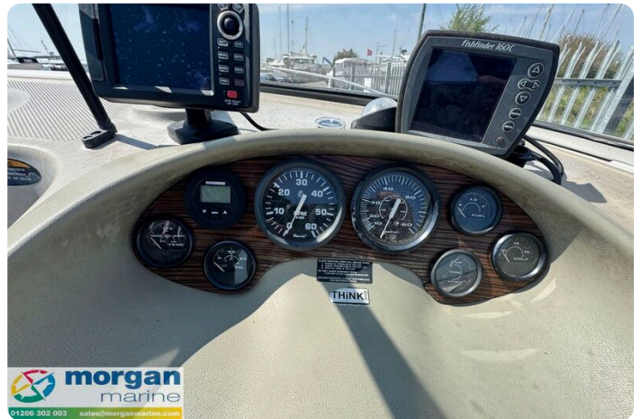
Bayliner 2252 -dash