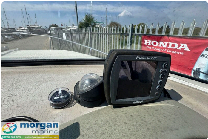
Bayliner 2252 - fish finder