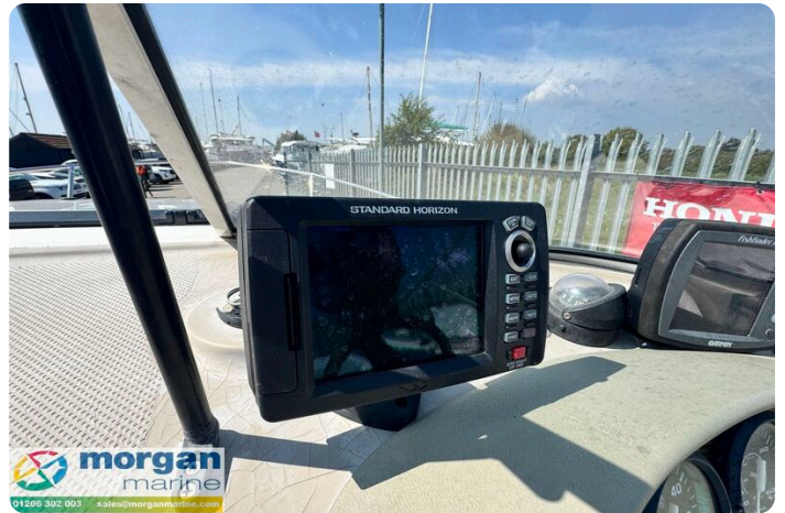
Bayliner 2252 - plotter