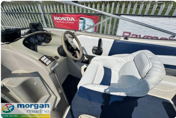
Bayliner 2252 - pilot seat