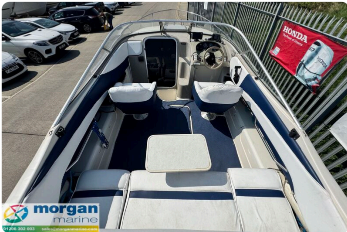
Bayliner 2252 - overview