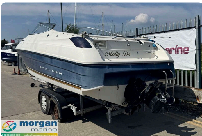
Bayliner 2252 - back viewing