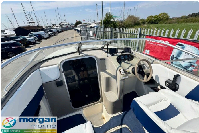
Bayliner 2252 - door