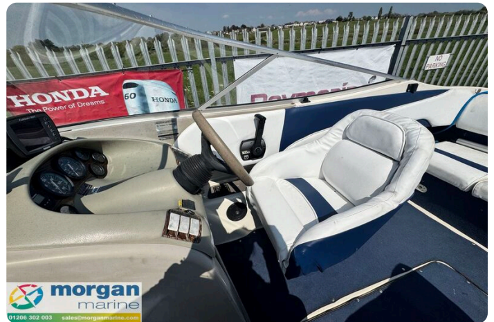
Bayliner 2252 - wheel