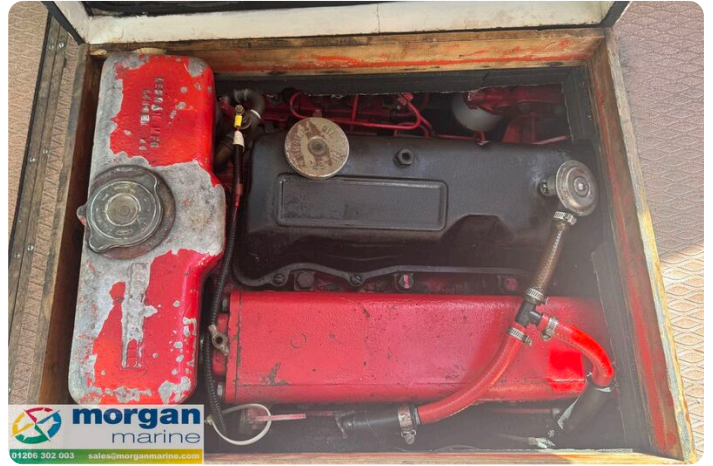
Aquastar 27 -engine