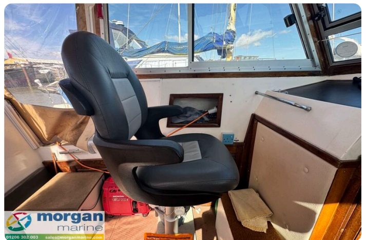
Aquastar 27 - co pilot seat