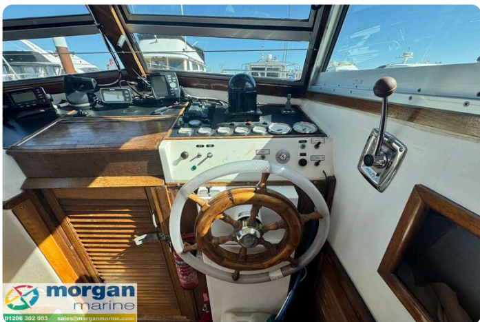
Aquastar 27 - dash