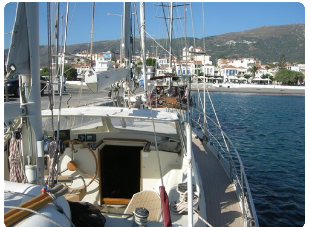
greicia 2013 227