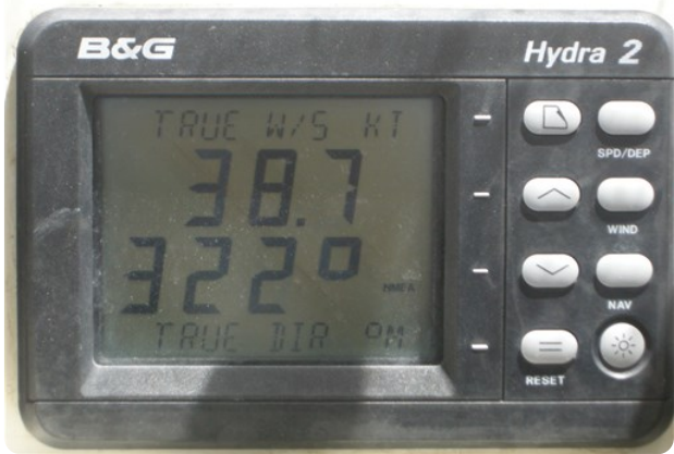
greCIA 2013 306