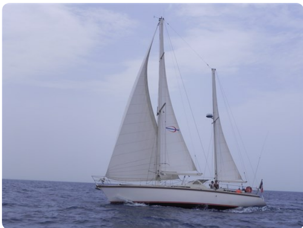
La Licorne 3